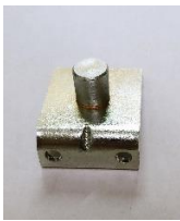
P/N SUB0025-01 Longer coil stop insert