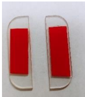
P/N PLS0096-00 Lock Down Bar Spacers