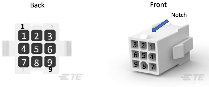
Figure 3: DBA conn. pin location

Step 3: Reconnect/Move the pins as per below table.