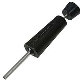
Figure 1: Pin extractor

Step 1: Power off the game and open the coin door with the key provided with your machine.